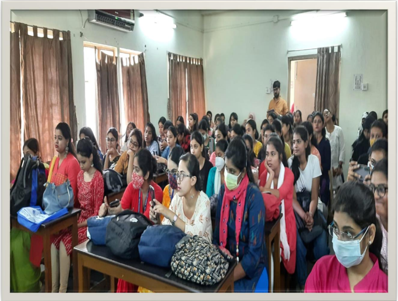
Students Participated in the Seminar