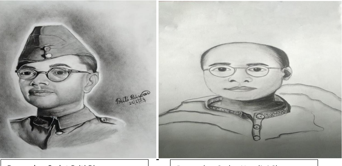
Drawn by: Cadet Priti Biswas