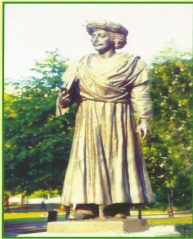
247th Birth Anniversary of Raja Rammohun Roy