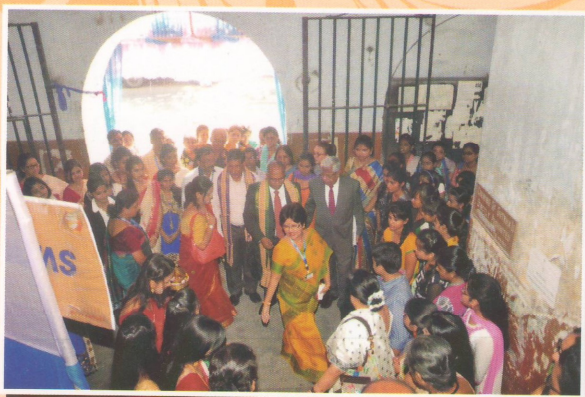
NAAC Team in College