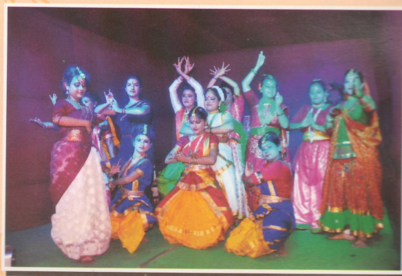
Students performing for NAAC Team