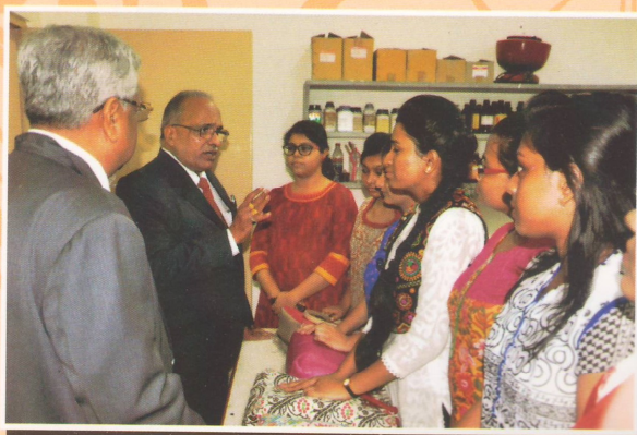
NAAC Team interacting with students