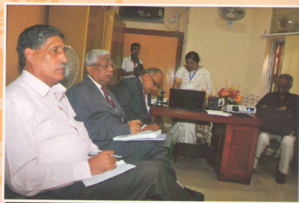
NAAC Peer Team, Principal and NAAC Co-ordinator