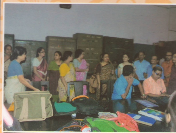
UNIVERSITY ACADEMIC AUDIT